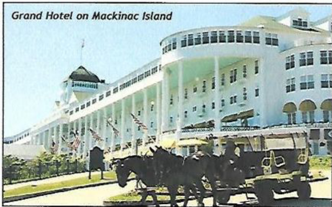
Grand Hotel on Mackinac Island

Beautiful Mackinac Island is suspended in a forgotten, more innocent time - a living Victorian village where transportation is limited to horse & buggy, bicycle, or on foot; motorized vehicles have been prohibited on the island since 1898.