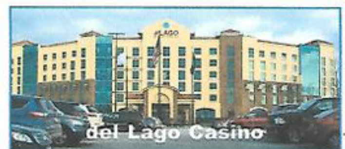
del Lago Casino

39 Saginaw Drive, Suite 24, Rochester, NY 14623