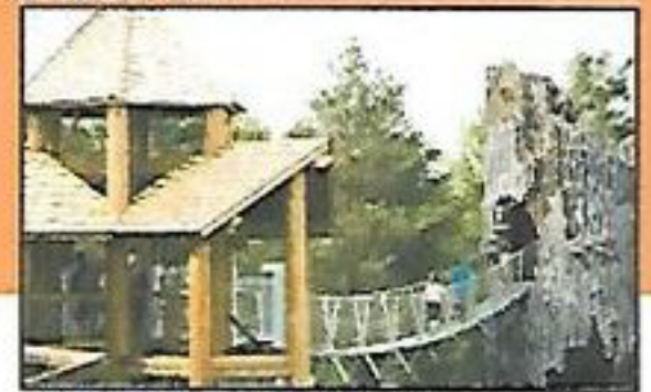
The Wild Center

Visit the Adirondacks newest and most famous museum in Tupper Lake - sight of the soft adventure, the Wild Walk. This stunning aerial walkway, at the top of 1,000 feet of bridges, is accessible for people of all ages. Besides the walk, the museum contains 34,000 feet of interactive exhibits, scores of live animals you can see up close, and a giant interactive sphere called Planet Adirondack.