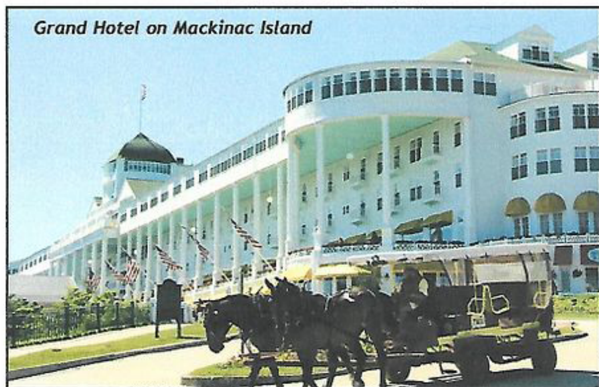
Grand Hotel on Mackinac Island

DARIEN SENIORS TUESDAY - FRIDAY, SEPT. 8-11, 2020