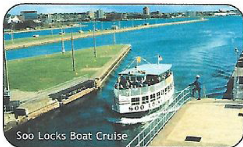
Soo Locks Boat Cruise

Explore the majesty of Michigan's Upper Peninsula, from the roaring waters of Tahquamenon Falls to the mighty freighters in the Soo Locks. Hear ghostly tales of sunken ships in mighty Lake Superior and see the recovered bronze bell of the Edmund Fitzgerald.