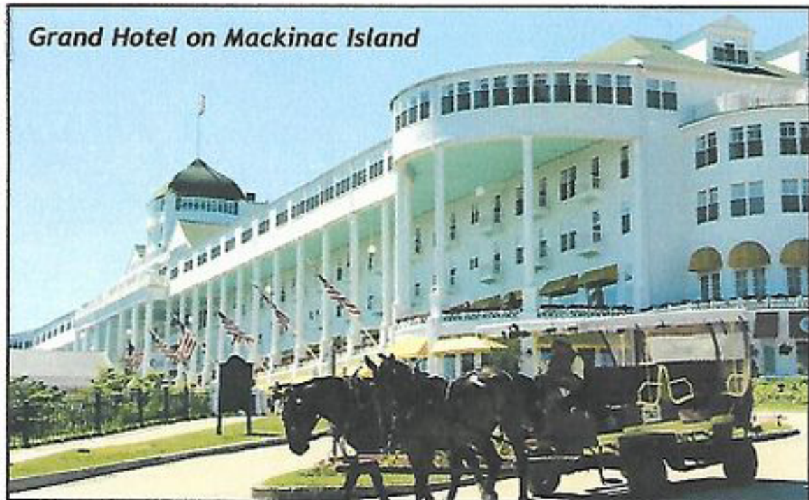
Grand Hotel on Mackinac Island

Beautiful Mackinac Island is suspended in a forgotten, more innocent time - a living Victorian village where transportation is limited to horse & buggy, bicycle, or on foot; motorized vehicles have been prohibited on the island since 1898.