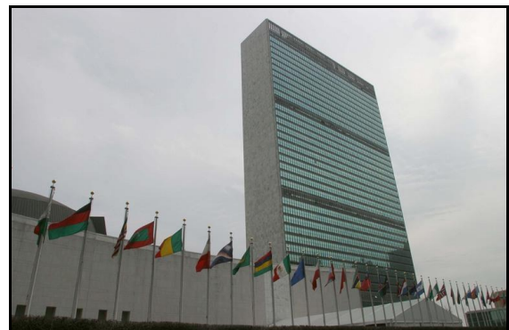
The United Nations Headquarters

Customize for your group, your preferences, your budget, your timeline!