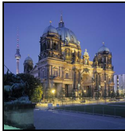
Berliner Dom - Berlin