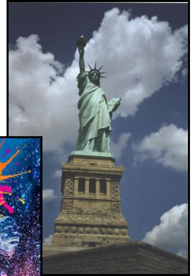
The Statue of Liberty

After breakfast at the hotel , transfer into Manhattan to visit the 9/11 Memorial & Museum , a monumental and moving tribute of remembrance and honor to the nearly 3,000 people killed in the terror attacks of September 11, 2001. Have free time for lunch at Hudson Eats (at your own expense), then depart on a Circle Line Liberty Cruise on the Hudson River to see the Statue of Liberty, Ellis Island, and a stunning panoramic view of midtown and lower Manhattan. Next, have some free time in midtown for shopping in chaperone-led groups. Early this evening, enjoy dinner at Ellen’s Stardust Diner , home of the singing waitstaff! Tonight, enjoy a performance of Blue Man Group , a dynamic combination of art, music, comedy and technology. Return to your hotel after the show. Overnight in New Jersey (hotel security provided).