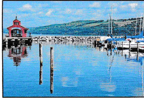
Watkins Glen & Seneca Lake