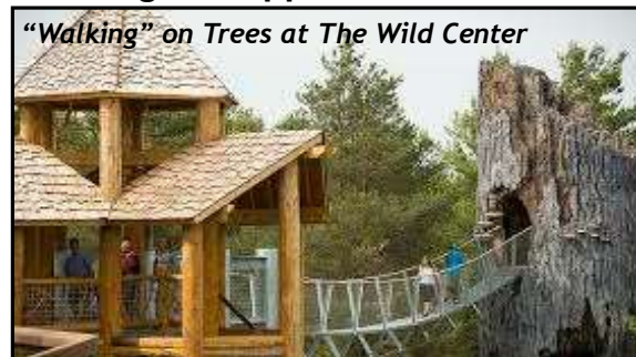
"Walking" on Trees at The Wild Center

Stop for shopping and lunch (on your own) in Old Forge on the way to the Adirondacks newest and most famous museum in Tupper Lake - site of the soft adventure, the Wild Walk. This stunning aerial walkway, at the top of 1,000 feet of bridges, is accessible for people of all ages. Besides the walk, the museum contains 34,000 feet of interactive exhibits, scores of live animals you can see up close, and a giant interactive sphere called Planet Adirondack. Dinner and overnight in Lake Placid.