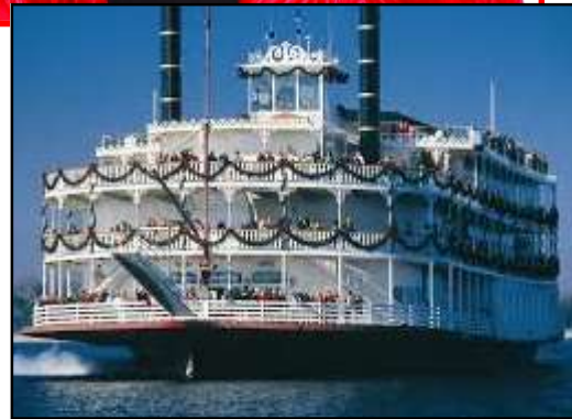
Branson Belle Showboat