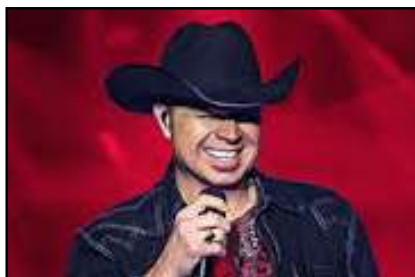
Clay Cooper Express