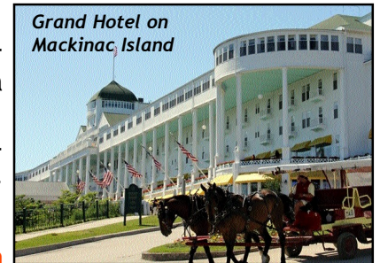
Grand Hotel on Mackinac Island