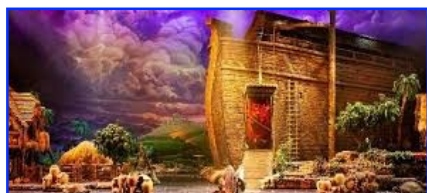
Scene from Noah

Pickups: Henrietta, Canandaigua & Clifton Springs