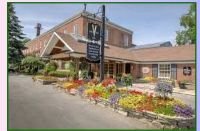
Pillar & Post

BALANCE: Travelers will be invoiced for the balance due in 2 installments: March 15 & April 15, 2025.