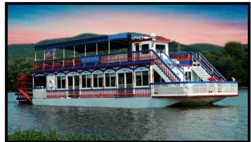
Hiawatha Paddlewheel Riverboat

Important Notes: Please arrive 10 minutes ahead of time listed at your pick-up - the bus cannot wait for late arrivals. Pick up locations are subject to change based on tour registrations, a minimum of 8 travelers needed per pick up. Registration confirmations will be sent by email 1-2 weeks prior to a trip to confirm the final schedule - please keep this schedule for your records.