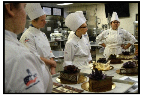
Le Jeune Chef

+ $10 FOR OPTIONAL MEDICAL CANCELLATION PROTECTION See reverse for details