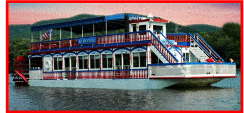
Hiawatha Paddlewheel Riverboat

$10 FOR OPTIONAL MEDICAL CANCELLATION PROTECTION See reverse for details