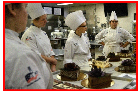
Le Jeune Chef